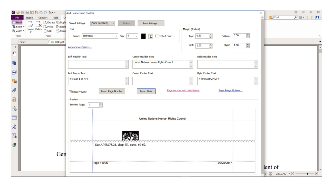
Quickly add dynamic headers and footers to your PDF