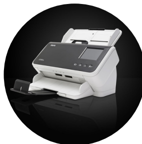
Alaris S2060w/S2080w Scanners