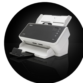
Alaris S2050/S2070 Scanners